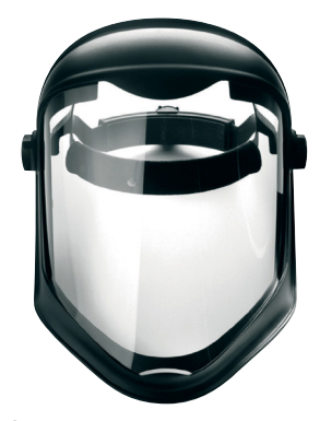
2,784 possible adjustement positions, 15 design patents, one revolutionary face shield.